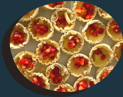
BAKED BRIE IN PHYLLO CUP $24 Topped with macerated strawberries